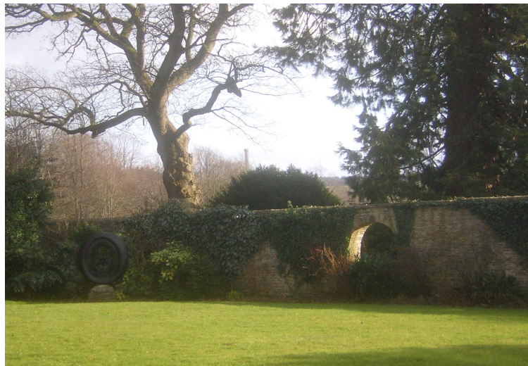
February morning at Ammerdown

Please do get in touch and share your ideas.